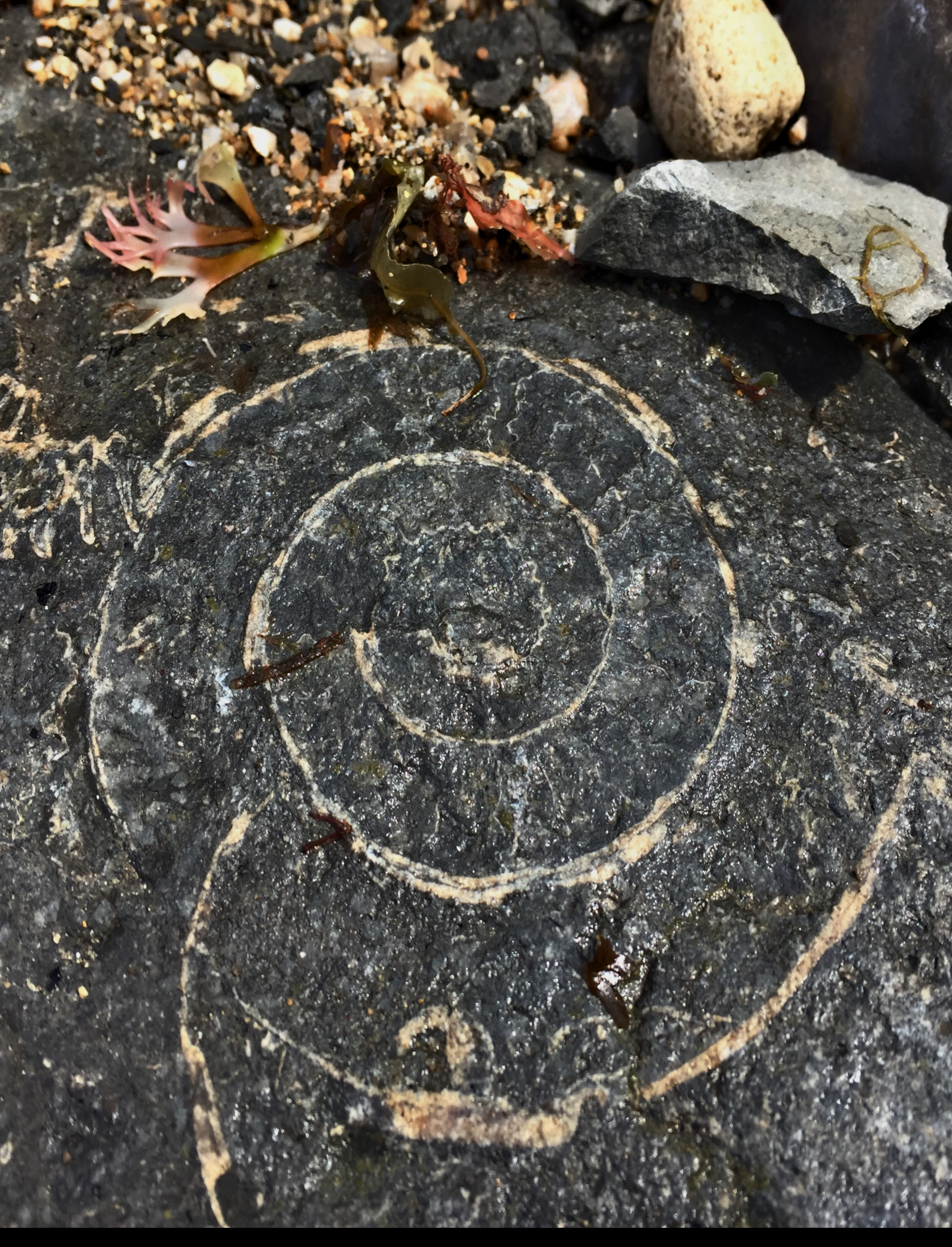
© Hampshire County Council/Isle of Wight Council/Portsmouth City Council/Southampton City Council 2021

ISBN: 978-1-85-975992-9 Published: November 2021